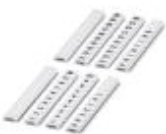
Zack Marker strip, flat, Strip, white, labeled, Printed horizontally: Consecutive numbers 1 - 10, 11 - 20, etc. up to 491 - 500, Mounting type: Snap into flat marker groove, for terminal block width: 5 mm, Lettering field: 5.15 x 5.15 mm

Zack Marker strip, flat - ZBF 5,LGS:FORTL.ZAHLEN - 0808671