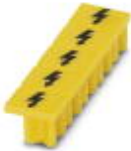
Warning cover, 5-pos., for terminal width: 5.2 mm

Zack Marker strip, flat - ZBF 5 CUS - 0825025