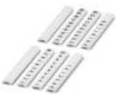
Zack Marker strip, flat, can be ordered: Strip, white, labeled according to customer specifications, Mounting type: Snap into flat marker groove, for terminal block width: 5 mm, Lettering field: 5.15 x 5.15 mm

Zack Marker strip, flat - ZBF 5 CUS - 0825025