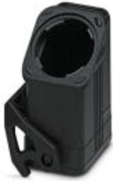
HEAVYCON EVO coupling housing, plastic, with bayonet flange for EVO screw connection, B6, with single locking latch, height: 90 mm, without EVO screw connection

Please be informed that the data shown in this PDF Document is generated from our Online Catalog. Please find the complete data in the user's documentation. Our General Terms of Use for Downloads are valid ( http://phoenixcontact.com/download )