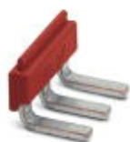
Insertion bridge, pitch: 6.15 mm, number of positions: 3, color: red

Insertion bridge - EB 3- DIK RD - 2716745