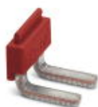
Insertion bridge, pitch: 6.15 mm, number of positions: 2, color: red

Insertion bridge - EB 2- DIK RD - 2716693