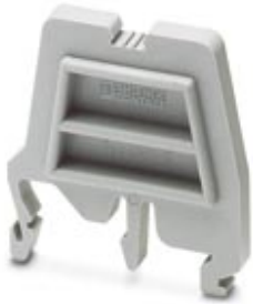
Flange cover, Length: 43.3 mm, Width: 5.2 mm, Color: gray

Please be informed that the data shown in this PDF Document is generated from our Online Catalog. Please find the complete data in the user's documentation. Our General Terms of Use for Downloads are valid ( http://phoenixcontact.com/download )