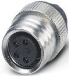
Sensor/actuator flush-type socket, 3-pos., M8, with straight solder connection

Please be informed that the data shown in this PDF Document is generated from our Online Catalog. Please find the complete data in the user's documentation. Our General Terms of Use for Downloads are valid ( http://phoenixcontact.com/download )