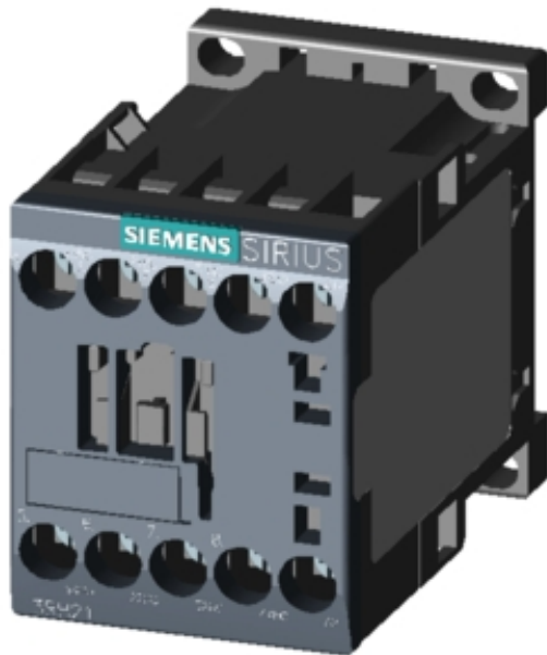
CONTACTOR RELAY, 2NO+2NC, DC 110V, SIZE S00, SCREW TERMINAL