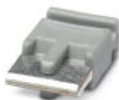
Single plug-in bridge, Length: 6 mm, Number of positions: 2, Color: gray

Single plug-in bridge - FBST 6-PLC GY - 2966825