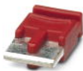
Single plug-in bridge, Length: 6 mm, Number of positions: 2, Color: red

Single plug-in bridge - FBST 6-PLC RD - 2966236