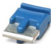
Single plug-in bridge, Length: 6 mm, Number of positions: 2, Color: blue

Single plug-in bridge - FBST 6-PLC BU - 2966812