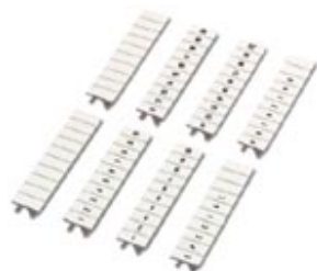
Zack marker strip, 10-section, horizontally labeled with the consecutive numbers: 221 ... 230, white, Width: 5 mm

Please be informed that the data shown in this PDF Document is generated from our Online Catalog. Please find the complete data in the user's documentation. Our General Terms of Use for Downloads are valid ( http://download.phoenixcontact.com )