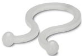
The illustration shows a version of the product

Cable drillers, for fast and tool-free bundling of conductors and cables, removable and reusable