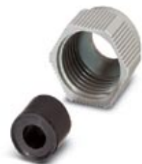
D-SUB cap nut with line seal, for conductor diameter of 3 mm ... 7 mm, for sleeve housing VS-15-...

Please be informed that the data shown in this PDF Document is generated from our Online Catalog. Please find the complete data in the user's documentation. Our General Terms of Use for Downloads are valid ( http://download.phoenixcontact.com )