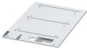
The figure shows the white version

Device marker, Card, silver, unlabeled, can be labeled with: THERMOMARK CARD, Mounting type: Screws, rivets, Lettering field: 75.6 x 54 mm