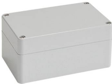
T 216 Order no.: 03216000