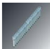
Fixed bridge, Number of positions: 20, Color: silver