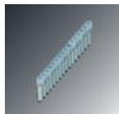
Fixed bridge, Number of positions: 16, Color: silver