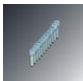
Fixed bridge, Number of positions: 12, Color: silver