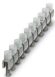
Fixed bridge, Number of positions: 10, Color: silver

Please be informed that the data shown in this PDF Document is generated from our Online Catalog. Please find the complete data in the user's documentation. Our General Terms of Use for Downloads are valid ( http://phoenixcontact.com/download )