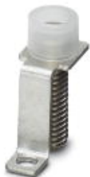
Step bracket, Number of positions: 2, Color: silver

Please be informed that the data shown in this PDF Document is generated from our Online Catalog. Please find the complete data in the user's documentation. Our General Terms of Use for Downloads are valid ( http://phoenixcontact.com/download )