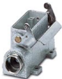
Box mounting base, with single locking latch, height 52 mm, without screw connection, 1x Pg16, with protective covers

Please be informed that the data shown in this PDF Document is generated from our Online Catalog. Please find the complete data in the user's documentation. Our General Terms of Use for Downloads are valid ( http://phoenixcontact.com/download )