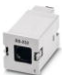
RS-232 connection for data transfer or software configuration