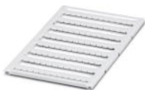
The figure shows the white version

Marker for terminal blocks, Sheet, violet, unlabeled, can be labeled with: BLUEMARK CLED, BLUEMARK LED, Plotter, Mounting type: Snap into flat marker groove, for terminal block width: 5.2 mm, Lettering field: 4.6 x 5.1 mm