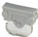
Feed-through connector, Length: 10.5 mm, Width: 4 mm, Color: gray

Feed-through connector - P-FIX - 3038956