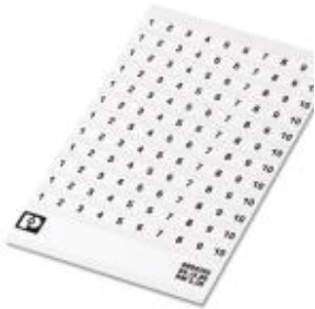
Marker card, self-adhesive, horizontally labeled with the consecutive numbers: 41 ... 50, 10-section marker strips with 12 identical decades, white

Please be informed that the data shown in this PDF Document is generated from our Online Catalog. Please find the complete data in the user's documentation. Our General Terms of Use for Downloads are valid ( http://download.phoenixcontact.com )