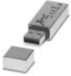
USB memory stick, 2 GB.

USB memory stick - 2 GB USB STICK - 2701382