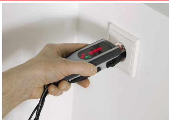
Plug in position

3 configurations are possible for connecting leads.