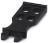
Strain relief, Number of positions: 2, Color: black