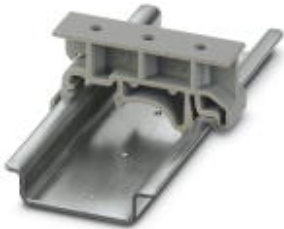
Rail adapters, for M3 screws, length: 42.6 mm, width: 10 mm, height: 19 mm, color: gray

Please be informed that the data shown in this PDF Document is generated from our Online Catalog. Please find the complete data in the user's documentation. Our General Terms of Use for Downloads are valid ( http://phoenixcontact.com/download )