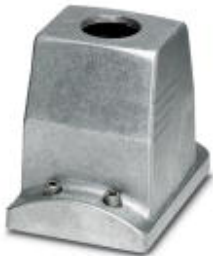
HEAVYCON ADVANCE B32 sleeve housing, for increased environmental requirements, EMC conductive, with Allen screw locking, with 1 x M32/2 x M20 straight cable outlet

Please be informed that the data shown in this PDF Document is generated from our Online Catalog. Please find the complete data in the user's documentation. Our General Terms of Use for Downloads are valid ( http://phoenixcontact.com/download )