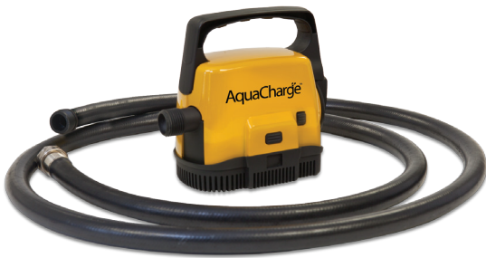
Submersible Pump and 2.45m (8')