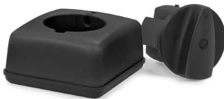
Battery and Charging Station