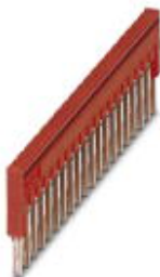
Plug-in bridge, Number of positions: 50, Color: gray

Please be informed that the data shown in this PDF Document is generated from our Online Catalog. Please find the complete data in the user's documentation. Our General Terms of Use for Downloads are valid ( http://phoenixcontact.com/download )