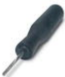
Assembly tool, for CK 1.6... crimp contacts for small conductor cross sections