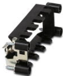
Sleeve frame, with PE connection to housing, for contact insert modules, type 4, number of insert modules: 5

Please be informed that the data shown in this PDF Document is generated from our Online Catalog. Please find the complete data in the user's documentation. Our General Terms of Use for Downloads are valid ( http://phoenixcontact.com/download )