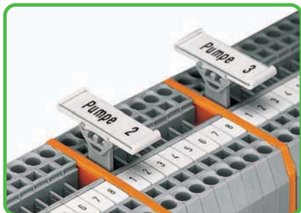
Group marker carriers