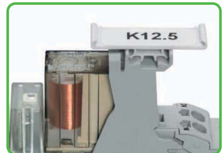
Group marker carrier with miniature WSB marker