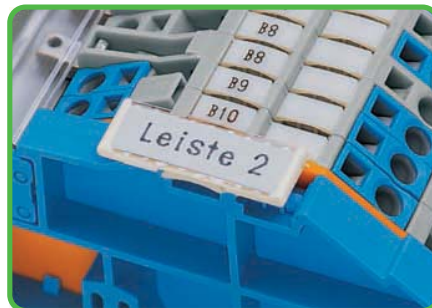
Group marker carrier with marker and protection cover