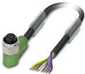
M12 socket, angled, 8-pos., with connected master cable, for sensor/actuator box with M8 slots, cable length: 10 m

Please be informed that the data shown in this PDF Document is generated from our Online Catalog. Please find the complete data in the user's documentation. Our General Terms of Use for Downloads are valid ( http://phoenixcontact.com/download )