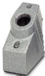
Powder-coated sleeve housing, with metric cable entry, locking screws with cylinder head

Please be informed that the data shown in this PDF Document is generated from our Online Catalog. Please find the complete data in the user's documentation. Our General Terms of Use for Downloads are valid ( http://phoenixcontact.com/download )