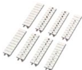
Zack marker strip, 10-section, horizontally labeled with the consecutive numbers: 191 ... 200, white, Width: 5 mm

Please be informed that the data shown in this PDF Document is generated from our Online Catalog. Please find the complete data in the user's documentation. Our General Terms of Use for Downloads are valid ( http://download.phoenixcontact.com )