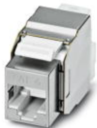
RJ45 socket insert, modular (Keystone), CAT6, 8-pos., shielded, with cable connection (LSA), for litz and solid wires AWG 26 ... 22

Please be informed that the data shown in this PDF Document is generated from our Online Catalog. Please find the complete data in the user's documentation. Our General Terms of Use for Downloads are valid ( http://download.phoenixcontact.com )