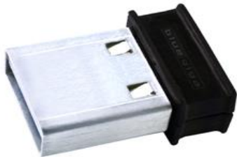
Figure 1: BLED112 Bluetooth Smart USB dongle

BLED112 Bluetooth Smart Dongle integrates all Bluetooth Smart features. The USB dongle can a virtual COM port that enables simple host application development using a simple application programming interface. The BLED112 can be used for Bluetooth Smart development. With two BLED112 dongles you can quickly prototype new Bluetooth Smart application profiles by utilizing Bluegiga Profile Toolkit™ and also automate in module software functions with Bluegiga BGScript™.