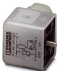
Valve connectors, 3-position, Valve connector A, with 1 LED, connected with Varistor, Screw connection, Cable gland Pg9, External cable diameter 6 mm ... 8 mm

Please be informed that the data shown in this PDF Document is generated from our Online Catalog. Please find the complete data in the user's documentation. Our General Terms of Use for Downloads are valid ( http://download.phoenixcontact.com )