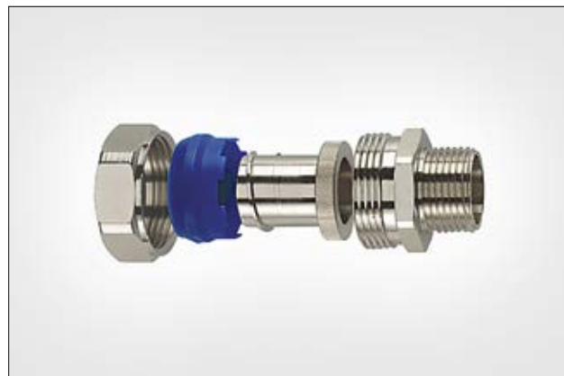
HeliaGuard PCS-FMC Compression Fitting.