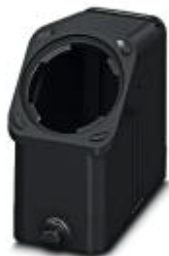
HEAVYCON EVO sleeve housing, plastic, with bayonet flange for EVO screw connection, B16, for single locking latch, height: 76 mm, without EVO screw connection

Please be informed that the data shown in this PDF Document is generated from our Online Catalog. Please find the complete data in the user's documentation. Our General Terms of Use for Downloads are valid ( http://phoenixcontact.com/download )