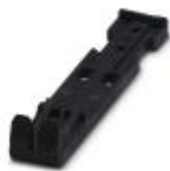
Strain relief, Color: black