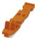
Latching, Length: 3 mm, Width: 3.5 mm, Color: orange