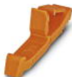
Latching, Color: orange