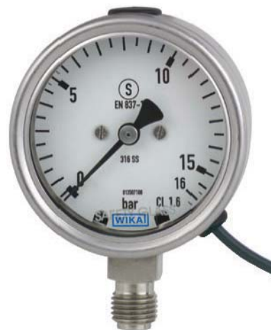
intelliGAUGE Type PGT23.063