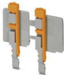
Flange cover, Length: 35.8 mm, Width: 4.5 mm, Height: 24.7 mm, Color: gray

Please be informed that the data shown in this PDF Document is generated from our Online Catalog. Please find the complete data in the user's documentation. Our General Terms of Use for Downloads are valid ( http://phoenixcontact.com/download )