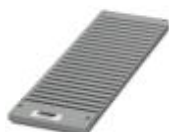
Plastic magazine for CMS-P1 plotter. Accepts 22 Zack band strips