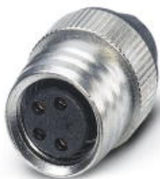
Sensor/actuator flush-type socket, 4-pos., M8, with straight solder connection

Please be informed that the data shown in this PDF Document is generated from our Online Catalog. Please find the complete data in the user's documentation. Our General Terms of Use for Downloads are valid ( http://phoenixcontact.com/download )