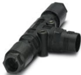
QUICKON T-distributor, black, 4+PE-pos., 1.0 mm 2 ... 2.5 mm 2 /690 V/20 A, for cable diameter of 9 mm ... 16 mm, with two QUICKON nuts

Please be informed that the data shown in this PDF Document is generated from our Online Catalog. Please find the complete data in the user's documentation. Our General Terms of Use for Downloads are valid ( http://phoenixcontact.com/download )