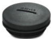
Filler plug, plastic, size: M40