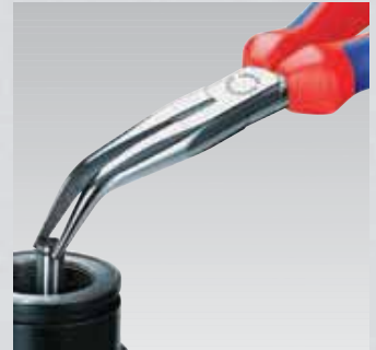
High loadable elastic precision tips

KNIPEX Snipe Nose Side Cutting Pliers (Stork Beak Pliers) are forged from Vanadium steel and carefully hardened. The slim precision tips withstand high demands, particularly bending loads.