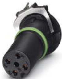
Sensor/actuator flush-type connector, socket, 4-pos., shielded, A-coded, with straight THR solder connection, only contact insert

Please be informed that the data shown in this PDF Document is generated from our Online Catalog. Please find the complete data in the user's documentation. Our General Terms of Use for Downloads are valid ( http://phoenixcontact.com/download )