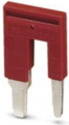
Reducing bridge, Number of positions: 2, Color: red

Please be informed that the data shown in this PDF Document is generated from our Online Catalog. Please find the complete data in the user's documentation. Our General Terms of Use for Downloads are valid ( http://phoenixcontact.com/download )