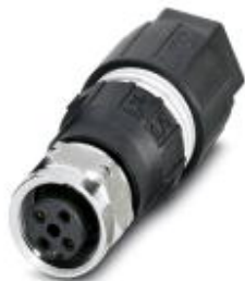
Sensor/actuator connector, Universal, 4-position, Plug straight M12, A-coded, Insulation displacement connection, Knurl material: High-grade steel, External cable diameter 4 mm ... 8 mm

Please be informed that the data shown in this PDF Document is generated from our Online Catalog. Please find the complete data in the user's documentation. Our General Terms of Use for Downloads are valid ( http://phoenixcontact.com/download )