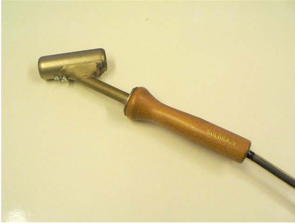
Iron featured without bit